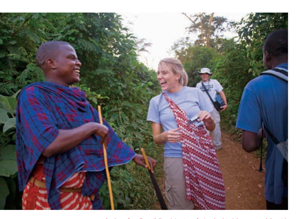
Students from Terry College's Institute for Leadership Advancement hike with Masai guides in Tanzania, Africa, as part of a study abroad experience.

cational experience. "We want to create an environment for learning," she says, "with faculty continuing to learn new ways of teaching and students challenging themselves to learn in new ways." It is a comprehensive approach to the core function of the university, one that takes advantage of all the institution's resources to create a constantly evolving learning environment.