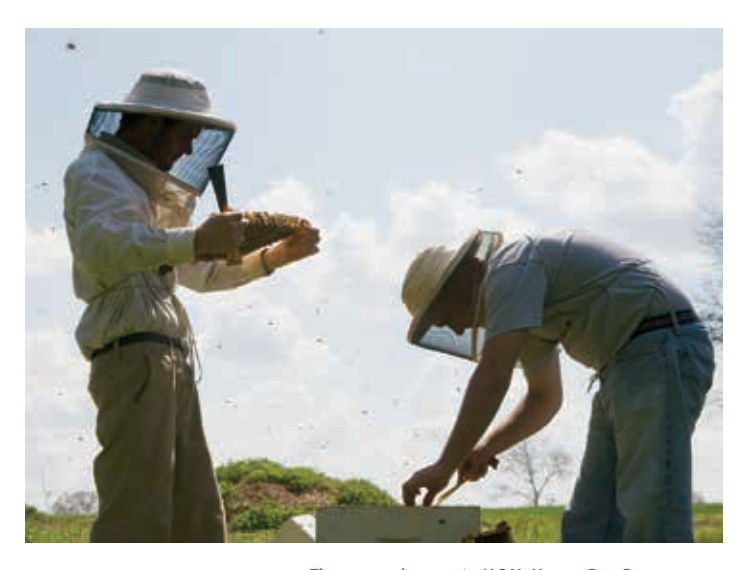
The research team in UGA's Honey Bee Program are working to identify the cause of honey bee decline.

he concluding phrase in the University of Georgia's motto defines concisely the role of research—"to inquire into the nature of things." At its heart, a university is a place of curiosity, of asking questions and seeking answers, of wonder and discovery—and also a place where students are imbued with the lifelong passion to ask and answer questions. "Building on Excellence," the strategic plan for the year 2020 at UGA, recognizes the importance of research with this statement: "Great universities are distinguished by world-class research."