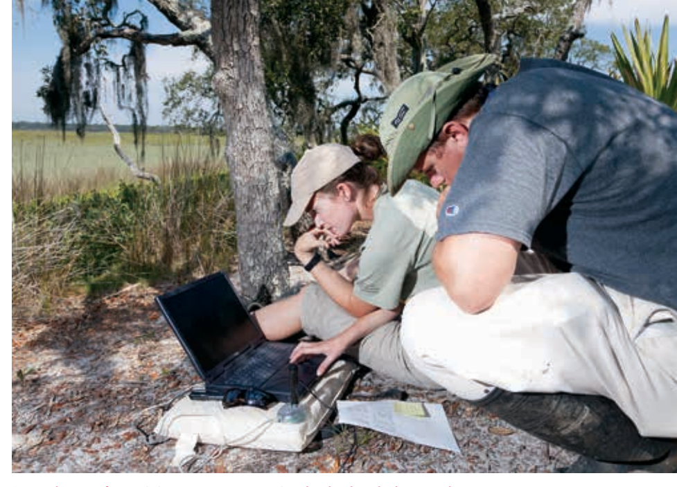
Research teams from UGA's Marine institute on Sapelo Island study the coastal processes and unique ecosystems on Georgia's barrier islands.

Research at UGA also serves the state through its role in Strategic Direction VII: Improving Stewardship of Natural