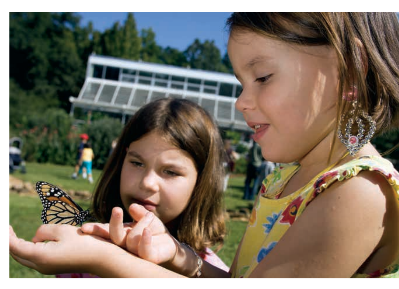
The State Botanical Garden of Georgia is committed to conservation of valuable natural resources and the education of children, students and the general public in the importance and the wonder of a healthy environment.

Georgia's challenges require UGA's resources more than ever, and the 2020 Strategic Plan supports the vision of the university as a crucial resource in making life better for all Georgians.